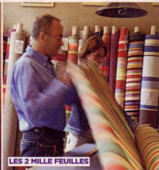
LES 2 MILLE FEUILLES