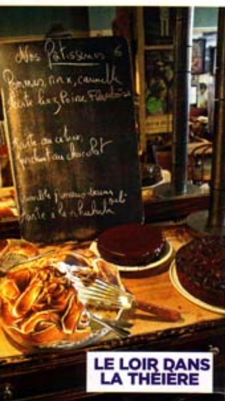
LE LOIR DANS LA THÉIÈRE