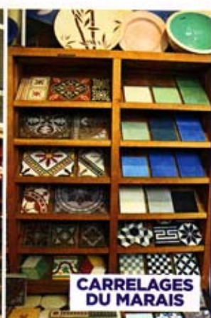
CARRELAGES DU MARAIS

"Your inspiration will come from effortlessly chic French design, and the ideas and pieces you bring home will always remind you of France."